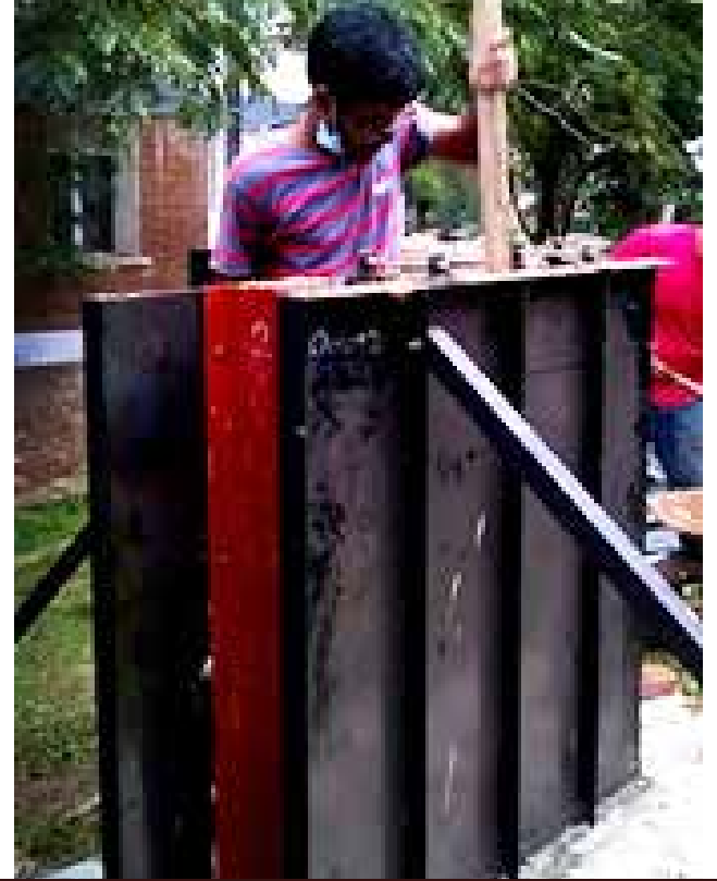
Assembling the formwork - Process of in-situ cast Mud-Conc rete wall construction

Prototype in-situ cast Mud-Concrete load-bearing wall models made for laboratory testing