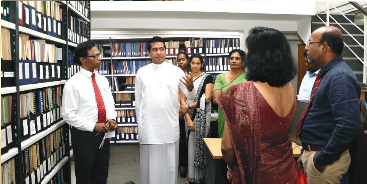
Subsequent to the speech, the Honorable Minister visited the National Science Library and Resource Center (NSLRC) and expressed his views to the staff on how the S & T information could be meaningfully delivered to the Chambers of Industries and the Private Sector, drawing attention to the global developments in the field.