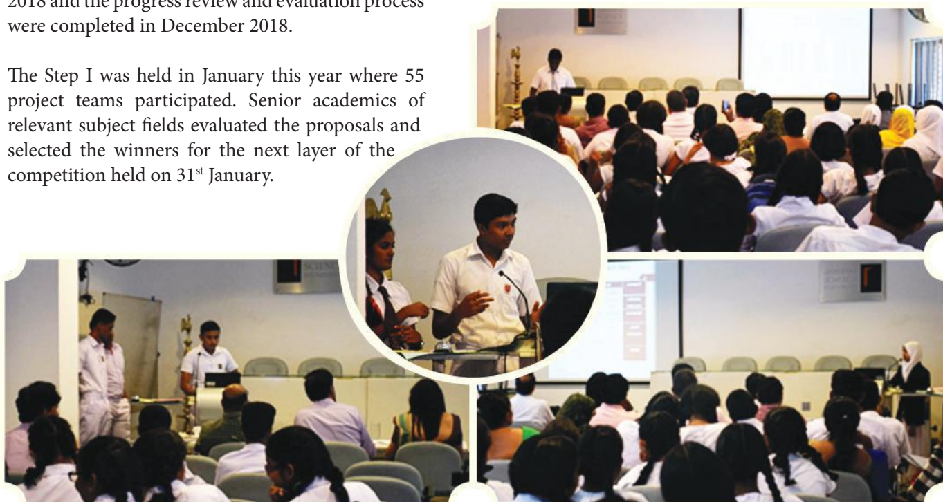
School Children presenting their Science projects at the SRPC

The Step I was held in January this year where 55 project teams participated. Senior academics of relevant subject fields evaluated the proposals and selected the winners for the next layer of the competition held on 31 st January.