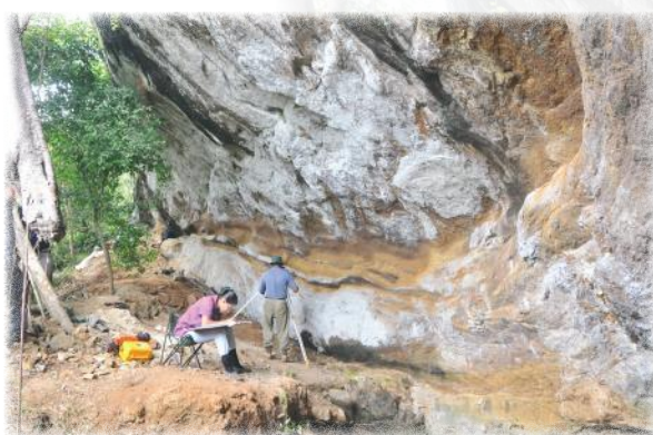
A view of the excavated rock-shelter called Lunugalge in Ilukkumbura of Balangoda.