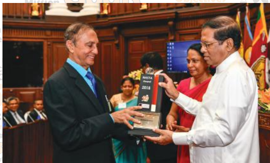
Mike Biotech Asia, The National Award winner under the Category “Development of viable substitutes for imports (acquired or adapted) and acquired or adapted technologies resulting in successfully exported products/services” for the project titled “Mass plant propagation by in vitro tissue culture technology”