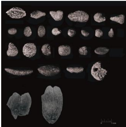
Some specimens of the excavated charred seeds recovered from the prehistoric contexts in the Lunugalge and Alugalge rock-shelters.

During the investigations done in the two-year period, five prehistoric cave occupations in and around Balangoda, associated with three distinct climatic zones, have been observed. Six excavations carried out during the project period have yielded a fairly large assemblage of artifacts which reflect the behavioral traits of prehistoric communities who occupied the investigated locations. Scientific dates (AMS) obtained have proven that all the caves excavated were inhabited by the prehistoric communities during the Holocene. Most striking evidence unearthed was a collection of plant residues (charred seeds) that has been dated to the mid-Holocene (4500 - 3450 BCE). Evidence reflecting an emerging new materiality of those prehistoric communities was identified. The sites and the artifacts together with Carbon-14 dates reiterate the fact that the hunter-gatherer/foragers of the mid/late Holocene had been receptive to the climatic changes of the contemporary period and the adaptive response is reflected in their material culture.