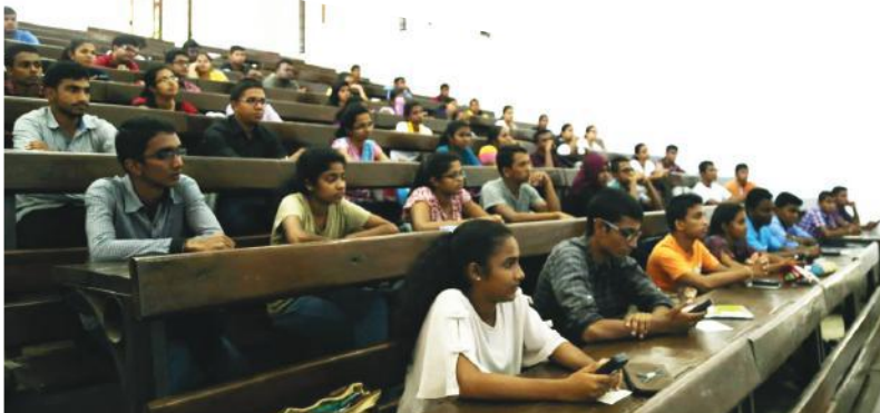
Student using Clickers at lectures