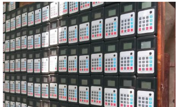
Hand-Held slave units (Clickers) with user-friendly keypads and LCD display units

A basic structure for multi-purpose student response system was developed and tested to conduct sessions with more than 100 students overcoming the difficulties faced with quiz mode teaching in a lecture theatre or in an examination setting. This device can be easily used to check the learning degree of students during a lecture/class room activity by using a few multiple-choice questions. How well the students have answered the questions can be immediately assessed for individuals as well as for the entire class or groups. During the project period, the device was tested for a group of 150 students. Hand-held slave units (Clickers) with user-friendly keypads and LCD display units were successfully fabricated and tested at the University of Ruhuna. The two-way communication capacity of the device is over 75 meters and the slave unit is rechargeable. The developed student response system is low-cost, flexible and can be easily customized. The objective of introducing this product is to upgrade the existing one-way teaching/communication system to a multi-purpose responsive system working in different modes; quiz mode, feedback mode and voting mode. The system was developed with the support of the technology grant awarded to a Research Team of the University of Ruhuna.